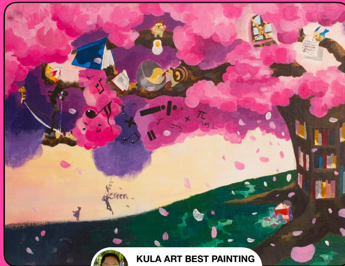
KULA ART BEST PAINTING 2018, "THE THINKING TREE" BY SEUINGMIN PAIK