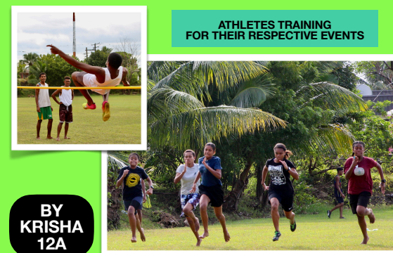
ATHLETES TRAINING FOR THEIR RESPECTIVE EVENTS

Success comes with determination, hard work and most importantly, teamwork and here in SVC these fundamentals are at the core of the athletes. They hope to bring glory to SVC once again and take the institution even further.